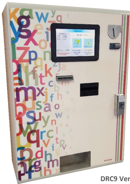
DRC9 Vending Wall version

Autonomous dispenser / reloader of magnetic cards for vending machines