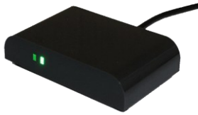
TCM3/TCM4: Readers of 13.56 Mifare or 125 KHz contactless cards