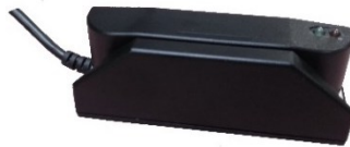
TCMAG2-USB: Reader of ISO magnetic cards