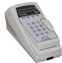
TCRS: Reader of CARTADIS magnetic cards compatible with cPad-Pay version only