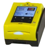
Credit card option

The CR10STD system is an optional equipment of the Gespage solution, it is connected to the server via a TCP/IP network. It enables GESPAGE user accounts to be both created and reloaded.