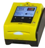
Credit card option

The CR10 system is an optional equipment of the Gespage solution, it is connected to the server via a TCP/IP network. It provides the reloading and creation of GESPAGE user accounts.