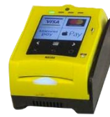
Credit card option

The DRC10STD system is an optional equipment of the Gespage solution, it is connected to the server via a TCP/IP network. It enables the creation of anonymous accounts and the reloading of accounts as well as the sale of contactless cards.